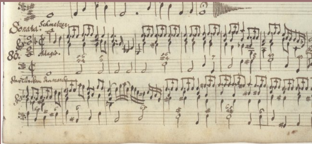
detail of beginning of a concordance with Sonata no.10 (Ms XIV 726 Wiener Minoritenkonvents)

Denkmäler der Musik in Salzburg, 14. Munich, 2008. Oblong, 32 x 25 cm, 88, xxx, 4 pp + 1 foldout. New color reproduction of the magnificent presentation copy (non autograph, sole surviving source), dedicated to the Archbishop Maximilian Gandolph von Khuenberg. These fifteen wonderful sonatas, abstract commentaries on biblical incidents traditionally grouped into three groups of five—Joyful (his early life), Sorrowful (his passion), Glorious (his resurrection)—are noteworthy for their use of scordatura and their powerful preludes. They originally were performed in the lecture hall "Aula Academica" of Salzburg University, which still contains fifteen paintings depicting the mysteries. In like manner biblical illustrations—small engraved medallions—were glued in the manuscript at the beginning of each piece. The work ends with the passacaglia for solo violin, one of the most beautiful and soaring pieces of the German baroque. This new facsimile edition